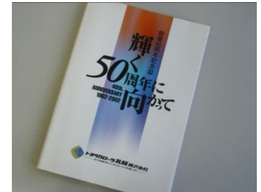
40th anniversary magazine