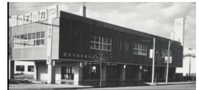
Head office building moved to Toyohira-ku