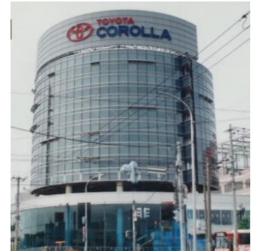
New head office building