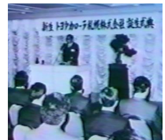
Merger celebration ceremony