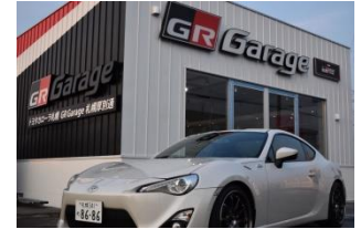
GR Garage Sapporo Atsubetsu road