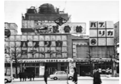
First head office building