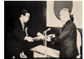
"TOYOTA Special Award ceremony"