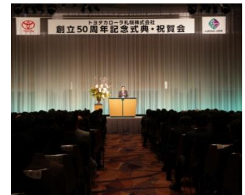
50th anniversary commemorative ceremony and celebration party