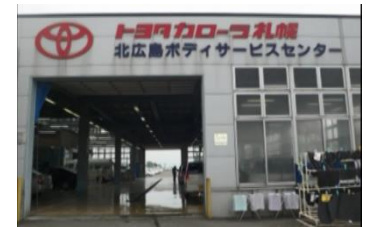
Kita-Hiroshima Body Service Center